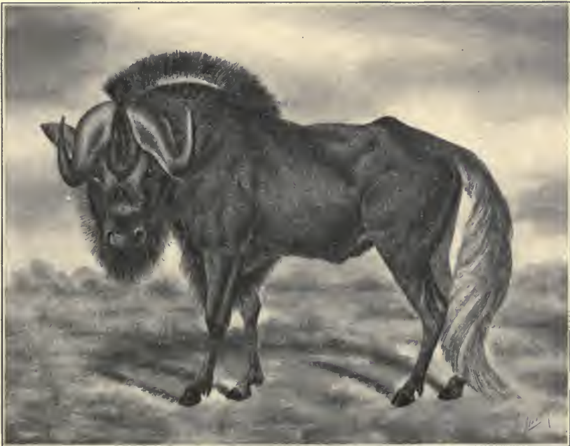
FIG. XIII. CONNOCHÆTES GNU. WHITE-TAILED GNU.

Connochætes taurina Lugard, E. Afr., I, 1893, p. 540, pl.